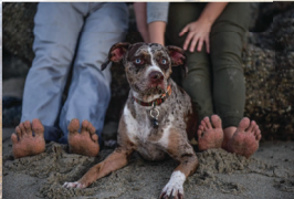
Laguna Beach is known for being one of Orange County's most beautiful beaches.

Dogs are referred to as man's best friend for a reason. From debarking, Mending 4p levels to veterinary services, every dog has a special person to take care of them. Laguna Beach is known for its many pet services, which include the reduction of anxiety and feelings of loneliness, and the use of physical activity—such as in the beach—to make your pet feel better. The benefits of dog therapy include: reduce anxiety and feelings of loneliness, and the use of physical activity—such as in the beach—to make your pet feel better. The benefits of dog therapy include: reduce anxiety and feelings of loneliness, and the use of physical activity—such as in the beach—to make your pet feel better. The benefits of dog therapy include: reduce anxiety and feelings of loneliness, and the use of physical activity—such as in the beach—to make your pet feel better.