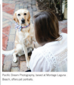
Bistro, Dog Beach & Beyond, offering pet services in Laguna Beach, offers pet services.